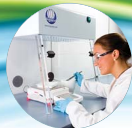
F3-XIT Small footprint weighing cabinets

For protecting the operator from hazardous airborne particulates and powders