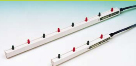
Ionising bars eliminate dust attraction and control the static environment.