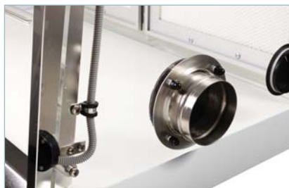
Waste bag port