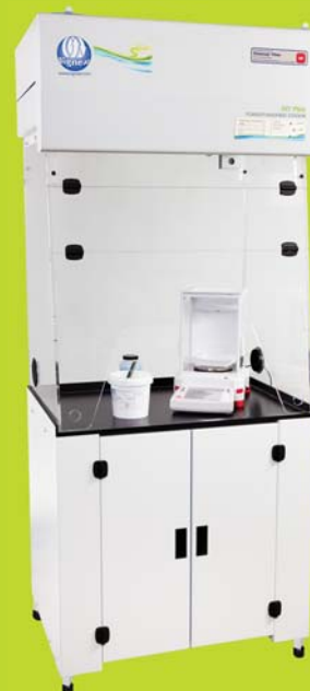
XIT Plus on optional stand