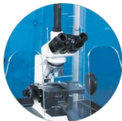
Specialist application and custom built Examples include: Asbestos Inspection Cabinets