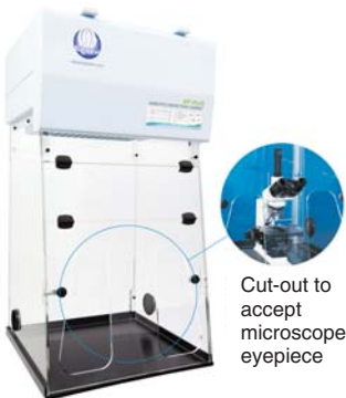
Cut-out to accept microscope eyepiece

Please tell us of your specific needs and our design team will offer a custom enclosure solution or bespoke finishing of a standard cabinet.