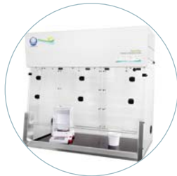
EXCEL Plus For more demanding weighing applications, turbulent free air flow