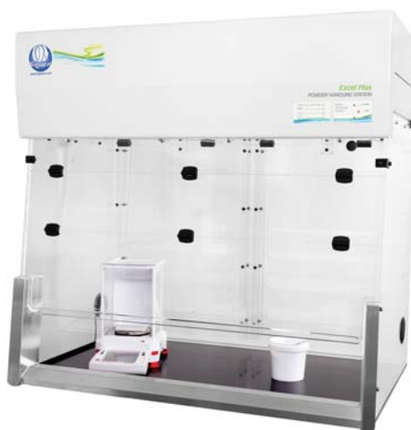
Excel Plus - recirculatory filtration

Options: Lighting (18W fluorescent lamp). Carbon filtration for chemical fumes. Ionising bars. ULPA Filtration upgrade. Static stand (open or cupboard). Spigot (200mm) for connection to house ducting (ducted model only).