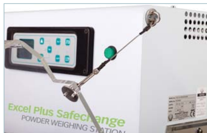
Door open stay