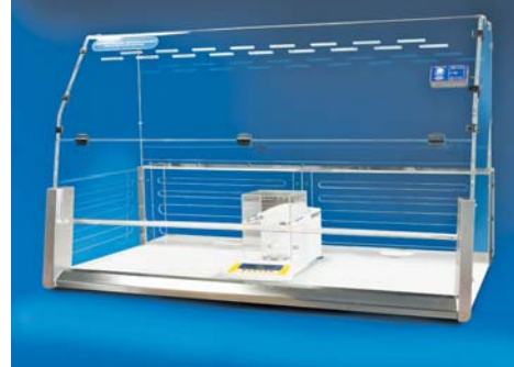
For installation into existing ducting