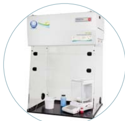
XIT Plus Larger cabinets, with more features