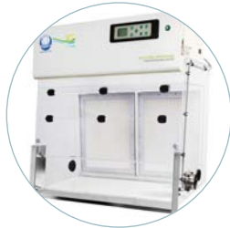
EXCEL Plus Safechange Cabinets for the most hazardous powders