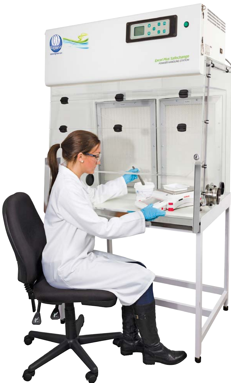
EXCEL Plus Safechange

Email: info@bigneat.com Tel: +44 (0)23 92 266400