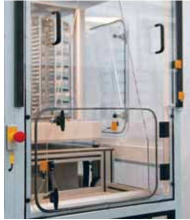
Variety of door arrangements