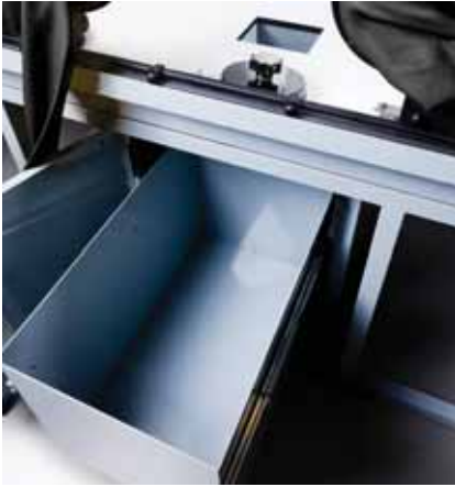
Ventilated waste tips & plates container

Improve reliability, improve productivity, improve safety.