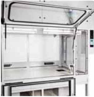
Gas strut assisted hinged doors provide full access to interior