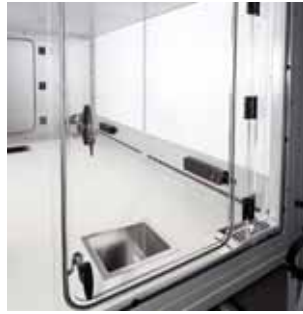
Inflow grilles (120mm depth), 16mm high impact laminate composite work surface with waste chute